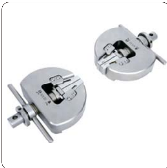
tensile fixture (optional)