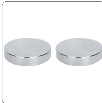
compression fixture (optional)