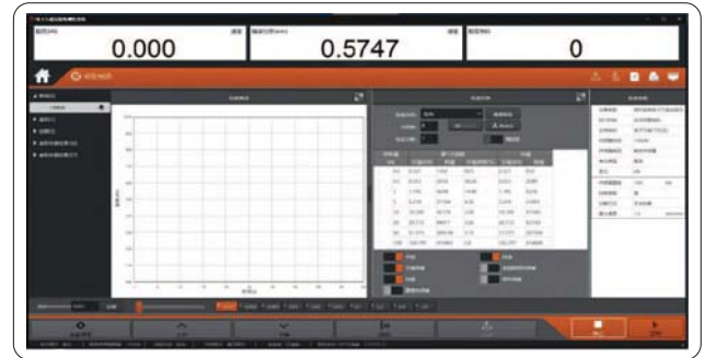
test and calibration interface