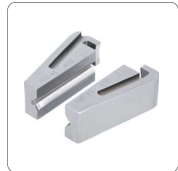
clamp blocks (optional)