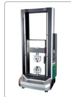
security door (optional)